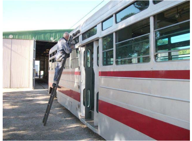
Bruce Lock working on the exterior of H1 381. Chris Summers.

If you have pledged a donation towards this project, your donation is needed as soon as possible. Members and friends are again asked to dig deep and contribute what they can to support the project, so that work to complete the shed can be rapidly progressed to allow the workshops to be re-established and for tram operations to return to the main depot fan.