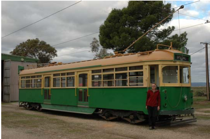
Charlie Rodgers poses with his handiwork on W7 1013 on 11 June 2011. Completion of the painting will be undertaken once the old shed, seen behind 1013, is replaced.

Repainting of 1013 commenced during April, however as it is one of the trams that is stabled outside during the shed replacement it was decided to hold back on completing the final coats of paint until it again is housed inside. The work completed by Charlie Rodgers and Jack Pennack on the initial coats of paint on the tram has resulted in an impressive finish on the resurfaced panels.