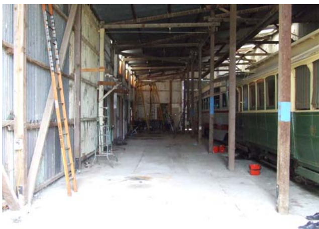
The old Workshop once most of the machinery and equipment had been removed.

During July the contractors who were engaged by the Museum for the demolition of the old shed were also engaged to assist in the removal of some of the surplus scrap that had accumulated at the rear of the Museum. Using their equipment, a speedy and safe clean-up of the back yard was achieved in a relatively short space of time, not only reducing the mess but also adding some much needed funding to the replacement shed project.