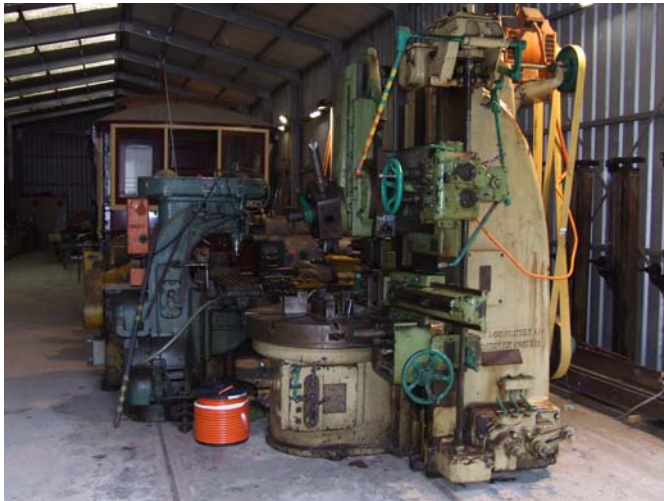
Machinery from the old workshop has been temporarily stored in the Bodyshop.