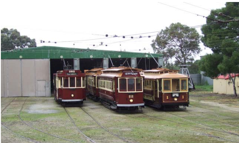
The ‘First Fleet’ in front of the Old Shed for the last time on 9 July 2011.

2 November 2001 – Road 10 was brought into use for the storage of trams.