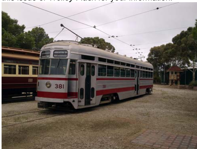
Car 381 captured out in the depot yard prior to operations on Sunday 22 May 2011.

At the AGM, the new Child Safety/Child Protection Policy was ratified as was a revision of the AETM's Safety Policy. Copies of both policies are attached to this issue of Trolley Flash for your information.