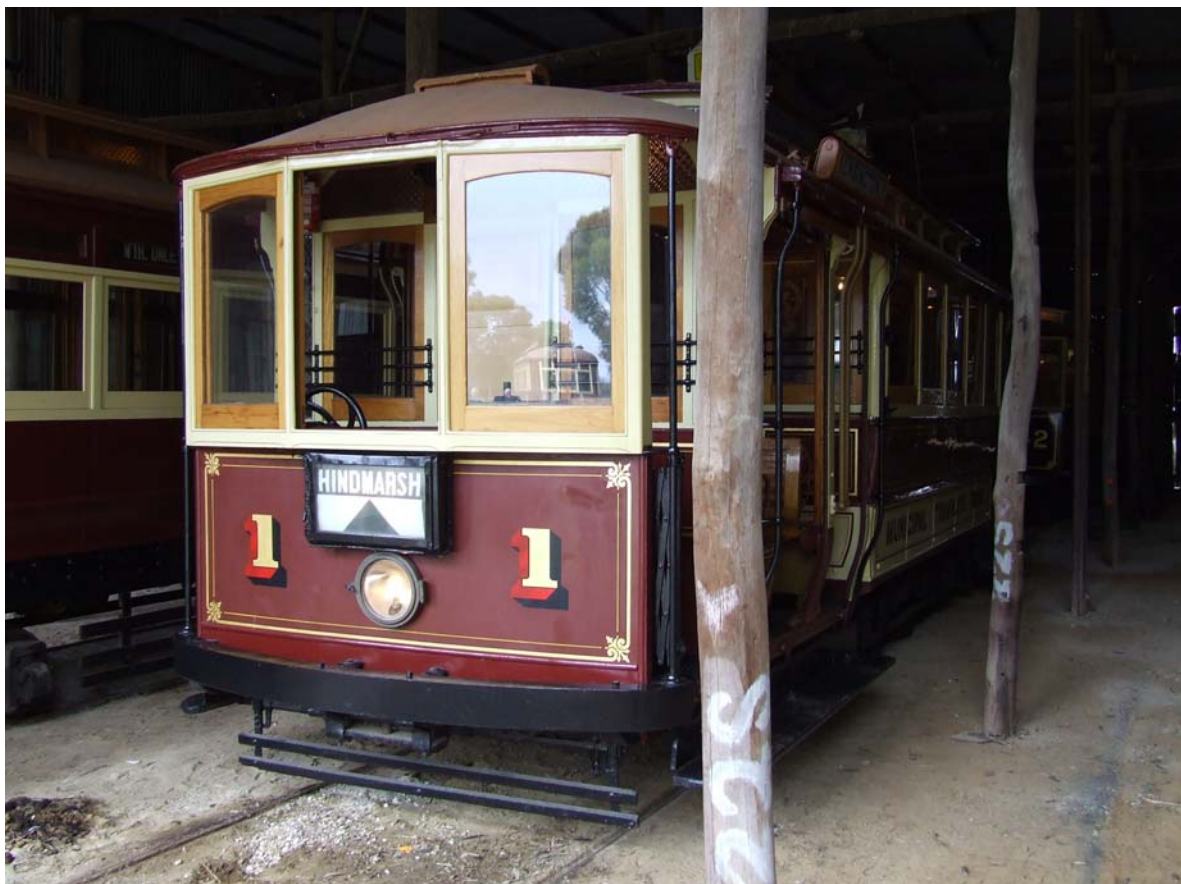
In the Old Shed for one last time on 9 July 2011, A Type No. 1 sits where it arrived and sat for a number of years on what is now road 5, with B Type 42 behind and E1 Type 111 alongside. Out of picture are D Type 192 and F1 type 282. H Type 364 sitting in the yard is reflected in No. 1's window.

Also, in recent weeks, Kym Smith and Chris Summers have put in a big effort to mow all the grass around the site. It's now looking really neat. This is in addition to the big effort being put in by the Friday and Sunday work gangs to empty the old shed (a huge task) and generally clean up the site a bit.