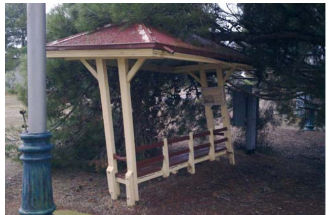
Unfortunately wild weather on Sunday 22 May 2011 caused a tree to fall on the old Children’s Hospital waiting shelter at the Museum. Ironically, tram operations on the day were unaffected.

Inclement weather and a white-ant-weakened tree saw the end of the waiting shelter on 22 May 2011. Like the inspector’s cabin, the shelter had suffered from lack of on-going maintenance over the years and proved no match for the large branch that split from a nearby tree. The collapsed pieces of the shelter have been removed to the back yard pending determination as to whether enough remains to allow it to be restored or whether it will only be suitable as a pattern for any replacement shelter.