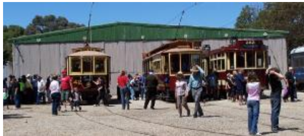
Some of the large crowd on the day.