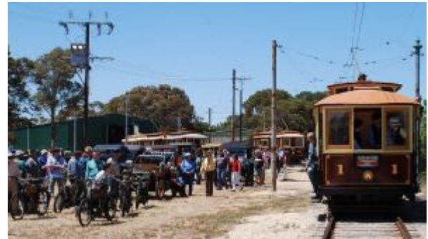
No. 1 gets ready for its re-enactment journey with vintage cycles and cars to its left.

Now, we ready ourselves for 8 March 2009.