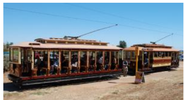
The two types of trams which opened the system in March 1909 – open crossbench 42 and combination car 1.